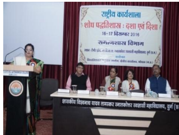
National Workshop in Sociology Department