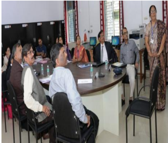
Presentation by IQAC Coordinator before NAAC peer team