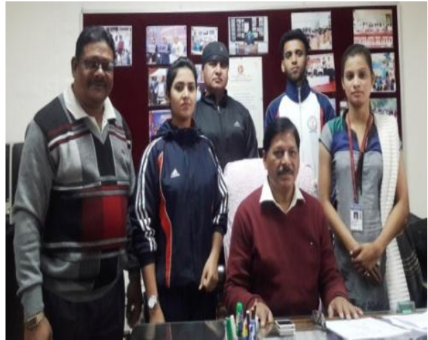
Best Sports Person of the College with Principal & Sports Officer