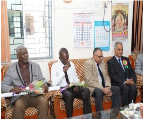
International participants present in the International Seminar