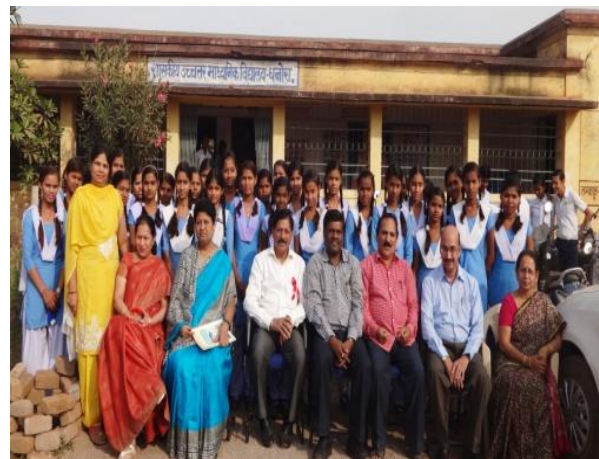
Extension Activity at nearby Village Dhanora