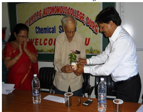
Inauguration of Chemical Society