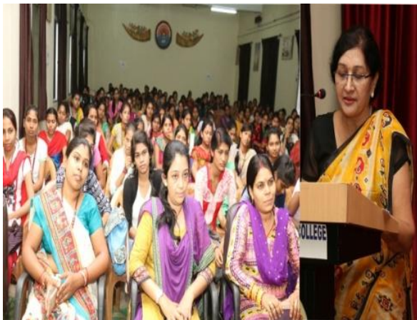
Health Awareness programme for Girls