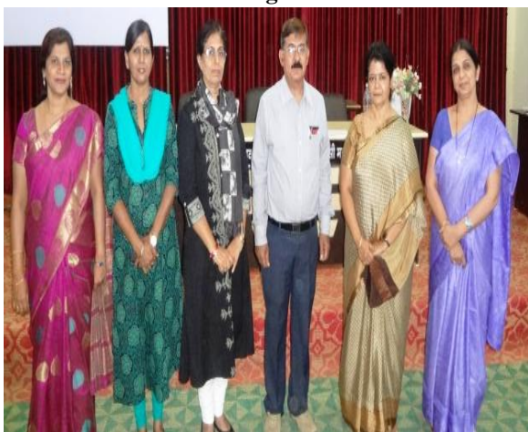
Invited Lecture organized by Department of English