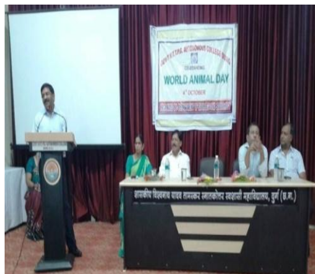
World Animal Day celebration in the College