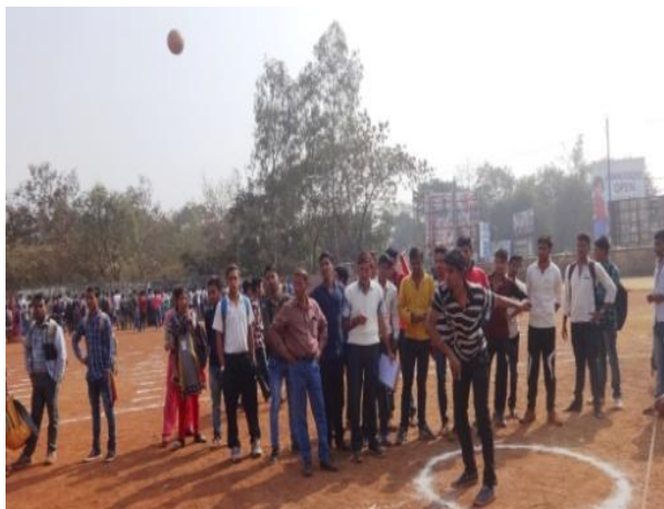
Annual Sports Day Celebration in the College