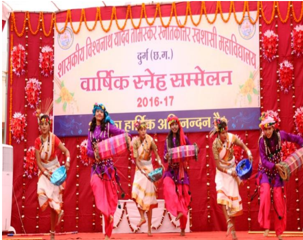
Annual Cultural function