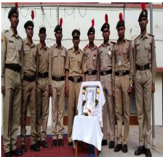
Tribute paid by NCC Officer & cadets of the College