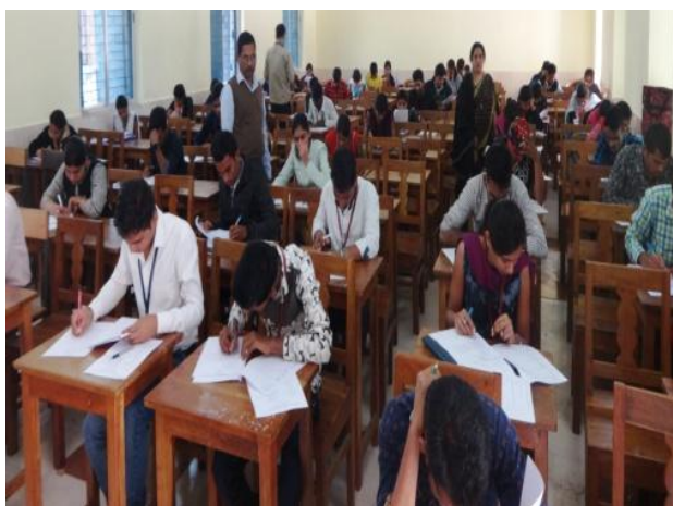
Campus Selection through Written Test