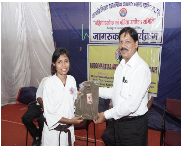
Awareness Programme for Girls