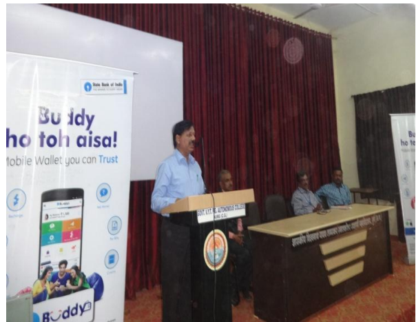
Digital India Campaign