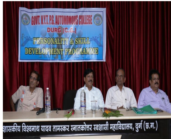
Personality & skill development programme